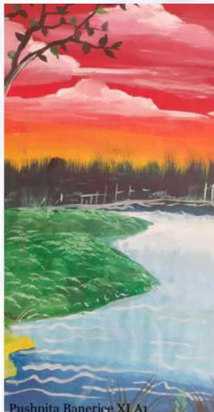
Pushpita Banerjee XI A1