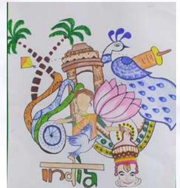
Sneha Poddar , 9 B1